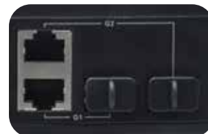
Combo Slot (1000Mbps RJ-45 / SFP)